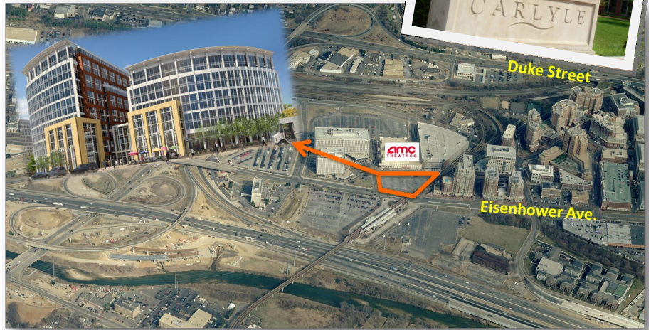
NSF's future Eisenhower Avenue headquarters-- Hoffman Town Center