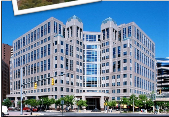
NSF's current Ballston headquarters-- Stafford Place

The NSF moved to the Ballston neighborhood in Arlington in the early 1990's and currently occupies more than 667,000 rentable SF in two adjacent office buildings -- Stafford Place I and II, located on Wilson Boulevard across from the Ballston Mall. NSF is considered to be one of Ballston's anchor office tenants, and a critical piece of Arlington's brand for that area.