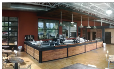
INSIDE ME SWING'S DEL RAY LOCATION