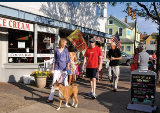
WALKABLE RETAIL STREETS