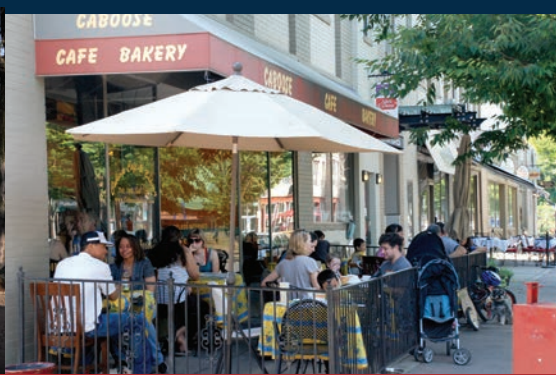
NEIGHBORHOOD GATHERING PLACES