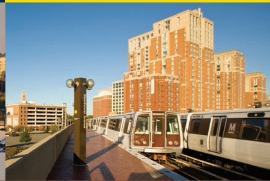
EISENHOWER AVENUE METRO STATION

of the City of Alexandria's East Eisenhower Small Area Plan. The Town Center currently has a state-of-the-art AMC Movie Theater with 22-screens and more than 4,000 seats, and an array of retail establishments, with additional restaurants slated to open soon. According to planners, the site will be "a year-round, outdoor promenade for families and people to gather, experience the arts and stroll at night."