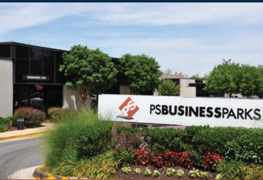
FLEX & TRADITIONAL OFFICE SPACE