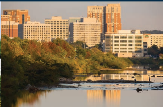
CAMERON RUN STREAM