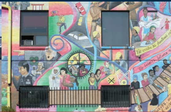
MURAL ALONG MT. VERNON AVENUE