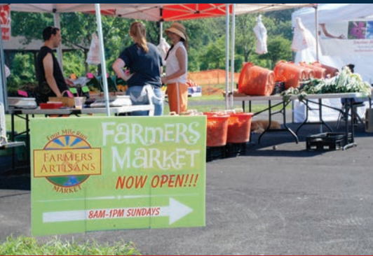
FOUR MILE RUN FARMERS MARKET