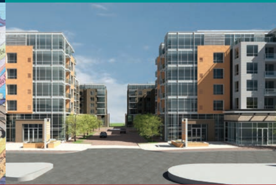
PLANS FOR MT. VERNON VILLAGE CENTER

In 2007, the City purchased four properties along the 4100 block of Mt. Vernon Avenue, with the intent of expanding Four Mile Run Park, which serves as a gateway to Alexandria from Arlington. In June 2011, the City continued its investment by converting the former Duron Paint Store, located at 4109 Mount Vernon Avenue, into a community building that now serves as a public facility for meetings, events and activities. Demolition of the building was considered, but a group of local architects, known as Architects Anonymous, volunteered their services to design a fair-weather, multi-purpose community center. The redesign of the landscape surrounding the community building includes a performance stage and a roll up door, creating a welcoming and dynamic public space for markets, concerts, and other cultural events.