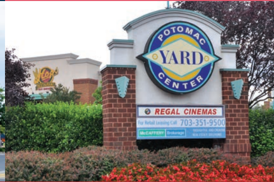
REGIONAL SHOPPING CENTER

existing shopping center, anchored by a new metro station. The plan envisions North Potomac Yard as a diverse community that is environmentally and economically sustainable, and is also compatible with adjacent neighborhoods. It focuses on the creation of dynamic urban forms, a complementary mix of land uses, community amenities, and a range of housing opportunities. The implementation of the plan will guide future growth and redevelopment by taking advantage of North Potomac Yard's strengths: planned economic diversity, a unique history, a future Metrorail station, proximity to the Ronald Reagan Washington National Airport, dedicated high-capacity transitway, and a central location in the region.