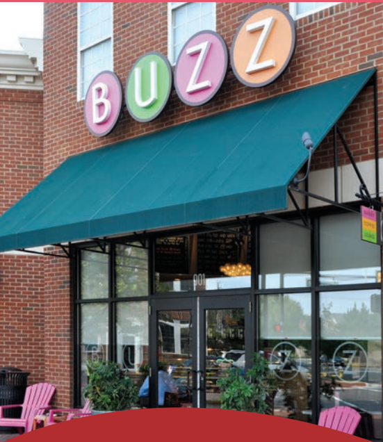
SHOPS AND RESTAURANTS AT POTOMAC GREENS