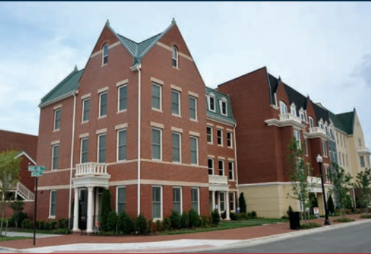
NEW RESIDENTIAL CONSTRUCTION